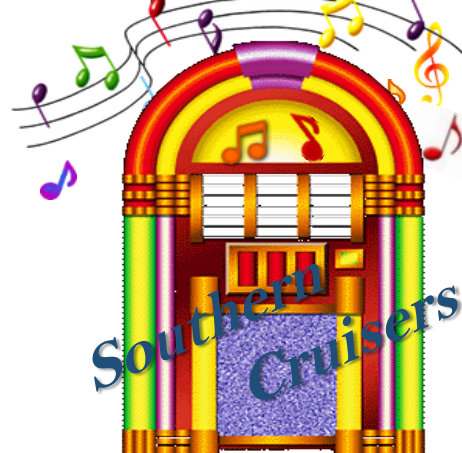
Auto and Truck Club Statesboro, Ga.